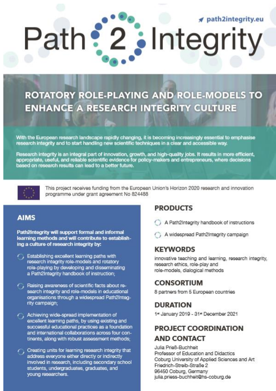
Figure 3: Path2Integrity poster

All promotional material is available on the project's public website.