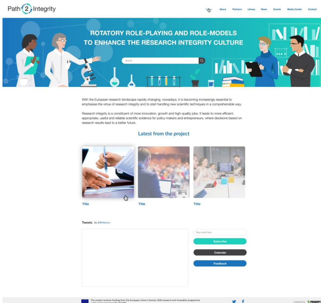
Figure 4: Homepage of the Path2Integrity website

Several versions of a tailored vector illustration have been created for the website header image. The setup and design of the header has been agreed upon in collaboration with project partners, such that it reflects the project's values, including research ethics and gender equality in research.