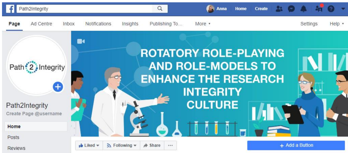
Figure 6: Path2Integrity Facebook page

Facebook remains one of the most popular social networks, providing a community-like space where news, links, photos and videos are easily shared. The Path2Integrity Facebook account can be found under the name @Path2IntegrityH2020.