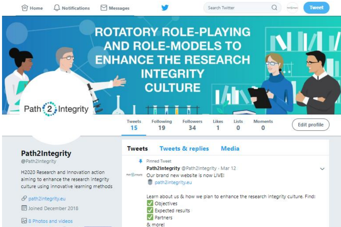
Figure 5: Path2Integrity Twitter account