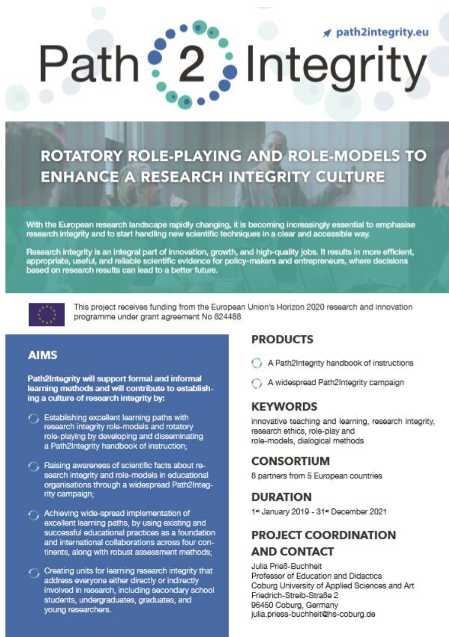
Figure 3: Path2Integrity poster

All promotional material is available on the project's public website.